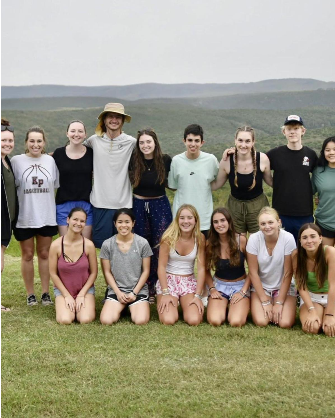
All of our 2023 STEM Camp Facilitators

2023 was the inaugural Holy Cross School STEM Camp