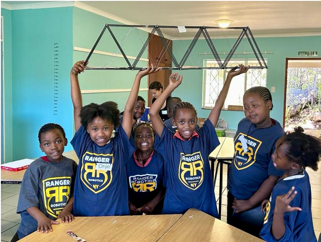
Happy Campers with a successful bridge build!